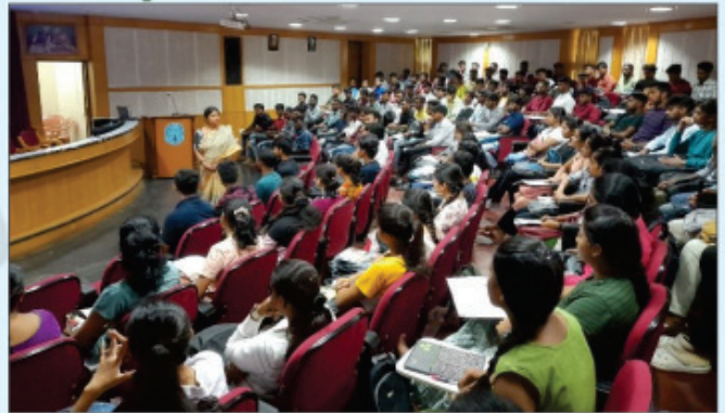
Inter-Intra Institutional Internship for 3rd semester students from 11th to 15th November 2022-Mech. Dept.