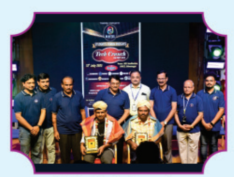
MCA-Tech Crunch -UG Fest-2023