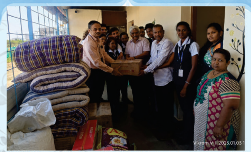
NOVA Trust Visit under BSR-Distributed Rice, fruits, Mattress, Pillow, Diapers worth Rs. 20,000