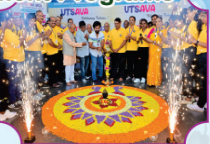
MBA-Utthana-2023-National Level UG Fest