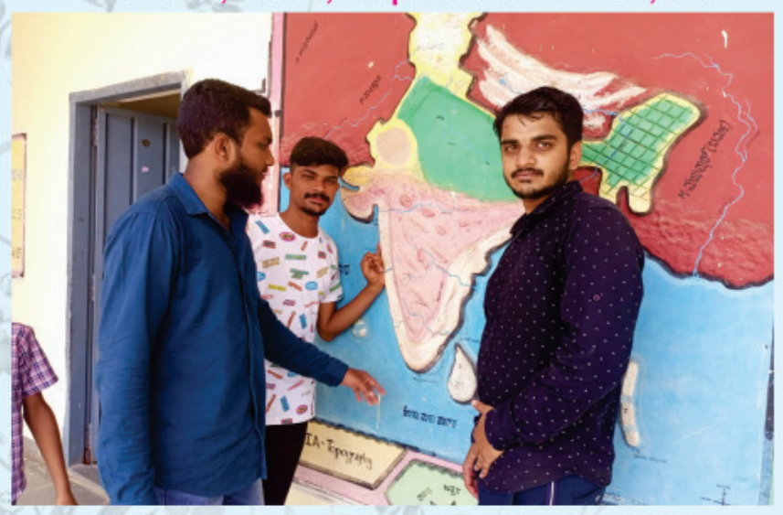
Civil Engg. students cleaned and painted Government School at Channamumbapura