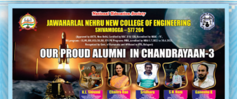
Alumni in Chandrayaan-3