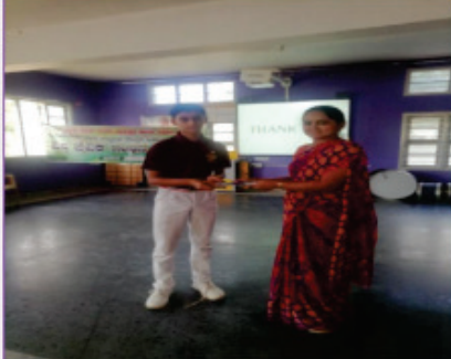
World Bio-fuel Day-2022 Quiz Competition prize distribution