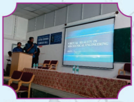
Mech. Engg. -Technical Paper Presentation competition for students