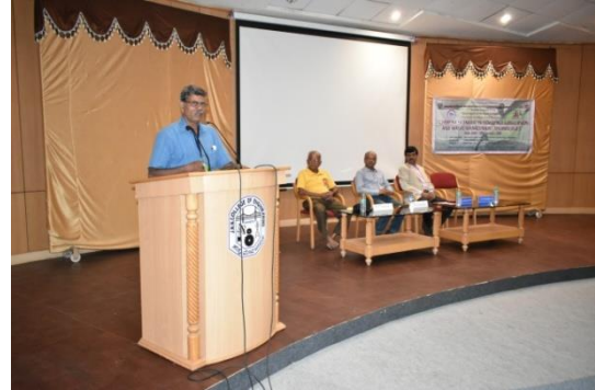
Valedictory function of the workshop