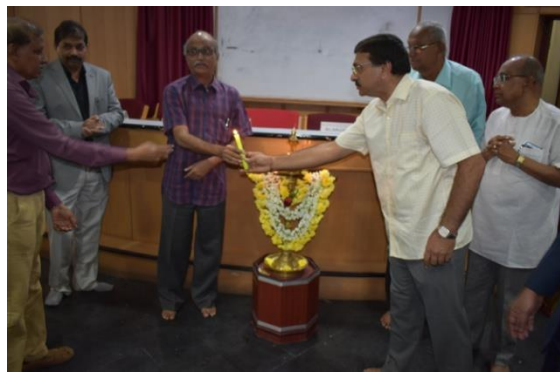
Lighting the lamp for inauguration by NES Management Members