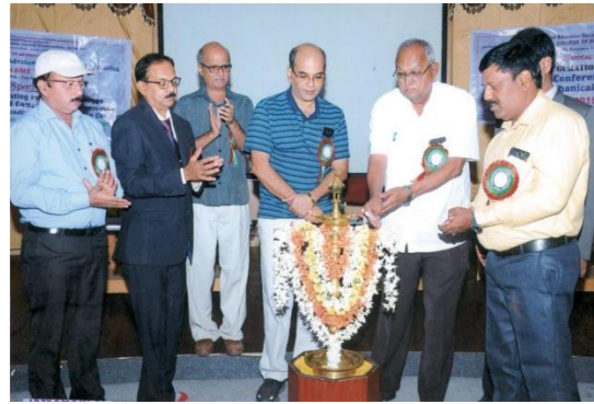
Inaugural by lighting the lamp