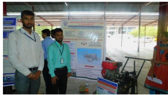
Mechanical Students Exhibiting Projects