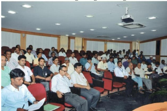
NAME 2018 gathering