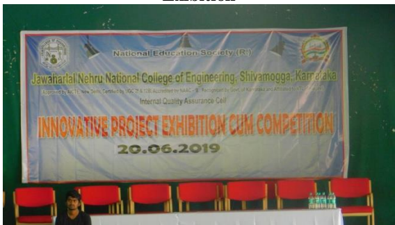
Stage Arrangements of the Project Exhibition