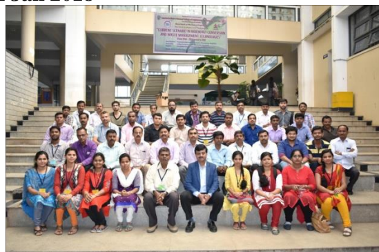
Participants of the workshop