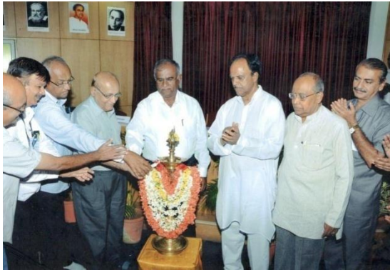
Inaugural ceremony of Workshop by NES Management Members