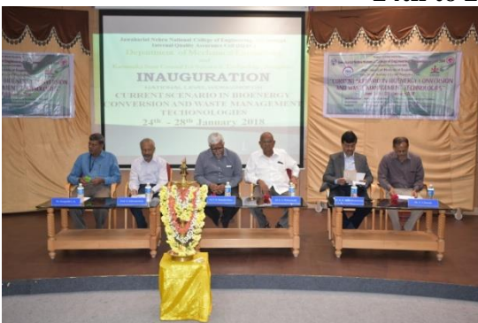
Inaugural function of the workshop