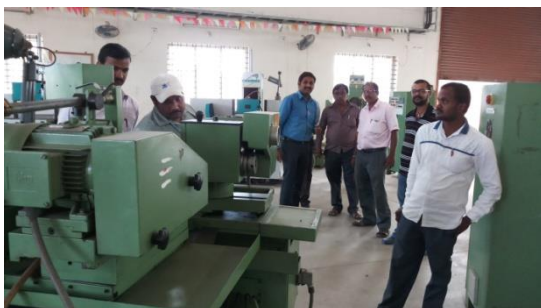
Field Visit to GTTC Machenahalli Shimoga