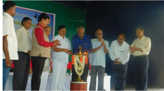
Inauguration by Light