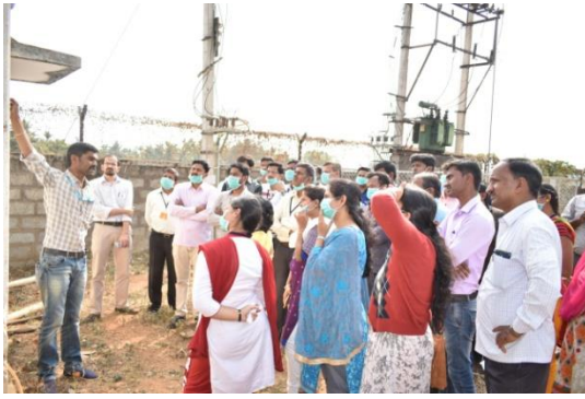
Participants visiting City Municipal Waste Management Zone, Hanpinnakatte, Shimoga