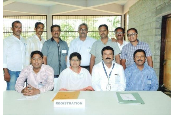
Registration team for the Workshop