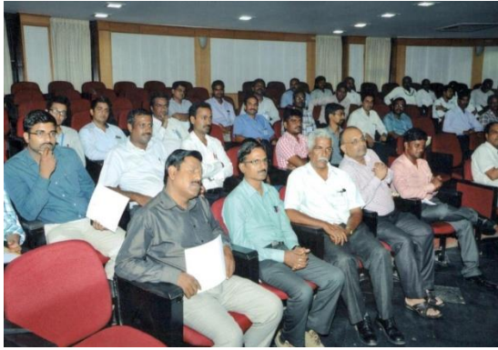
Gathering to the Workshop