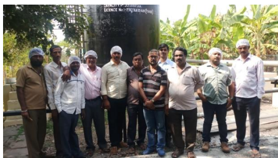
Lab Instructors as participants