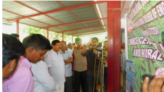
Projection Exhibition Stall of Students