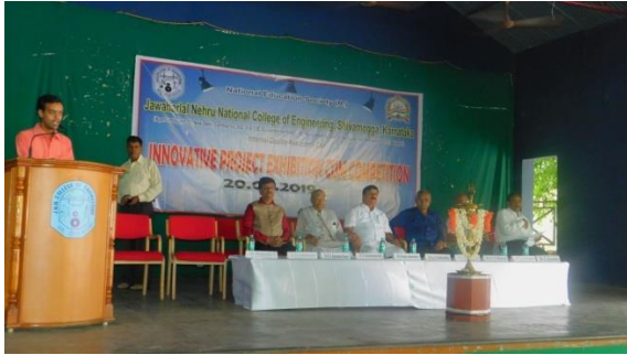
Inaugural Function of Project Exhibition