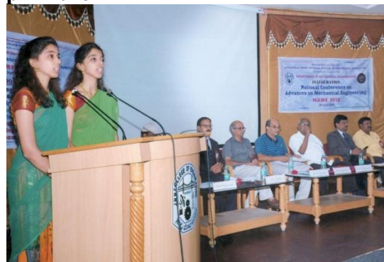
Invocation by Students in the Inaugural Ceremony