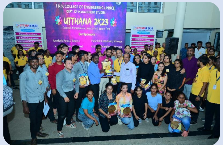
NESIAs, Shimoga Utthana Overall Champion 27/04/2023