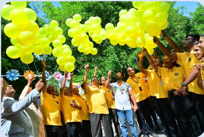
Utthana Inauguration by Actor Purvthi Ambar by relishing balloon on 27/04/2023