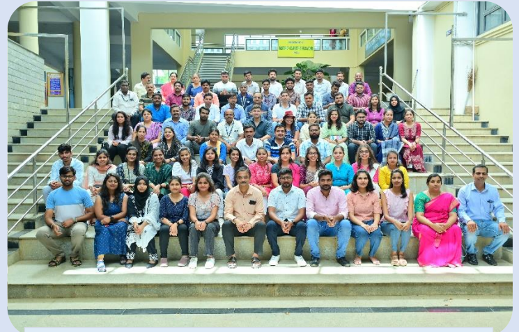
Department level Alumni Meet @ Global Alumni Meet on 27.05.2023