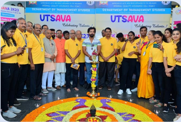
Utthana Inauguration by Actor Purvthi Ambar on 27/04/2023