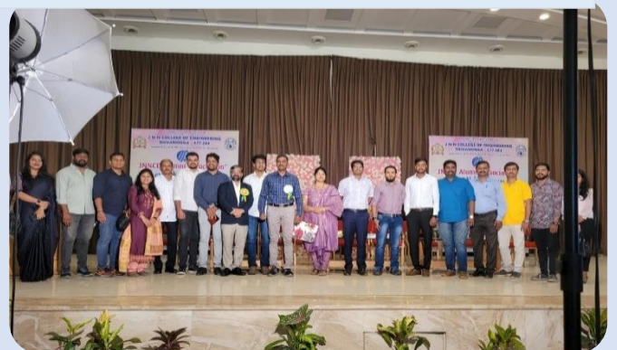
Alumni Group Photo of 2011-13 (10 Year Milestone Batch )@ GAM