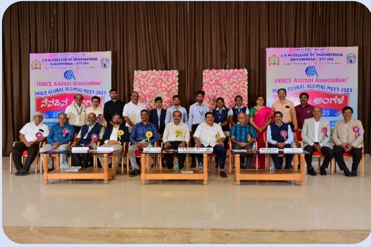
Merit-Cum-Means Scholarship Sponsored MBA Alumni @ Global Alumni Meet