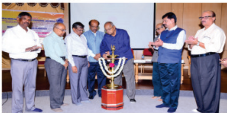
Inauguration of National Conference NCRTASCE-2019: Maths Department