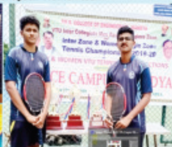
Tennis Men team