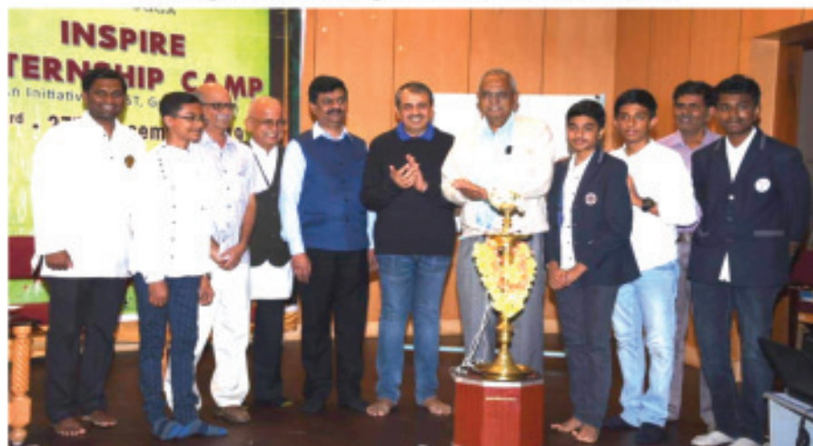
Inauguration of DST INSPIRE Internship Camp