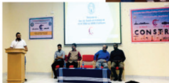
Training on Synchro & Sidra Software-Civil