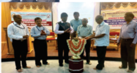
Skill Development Program for Transportation & Hostel Staff - JNNCE