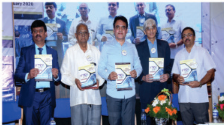
Release of Karnataka Tech-Entrepreneurship Summit 2020 Souvenir