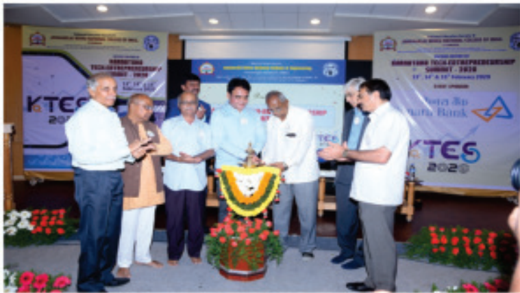
Inauguration of Karnataka Tech Entrepreneurship Summit - 2020