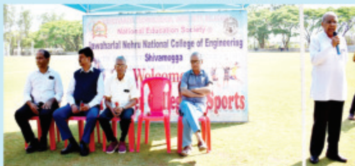
Mens Cricket tournament