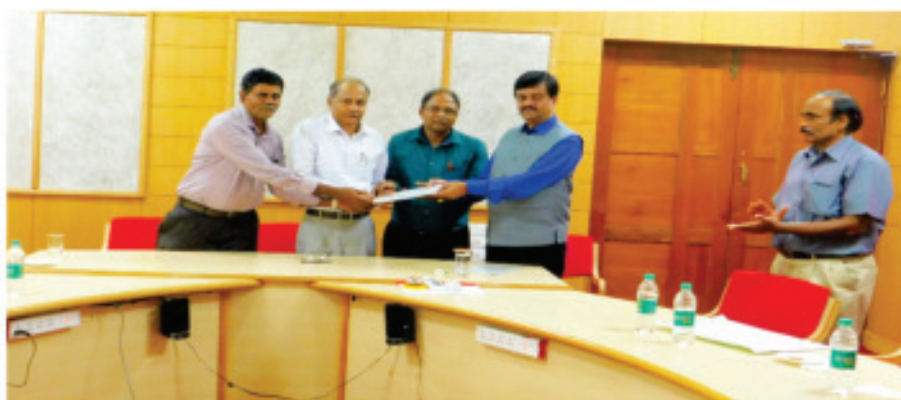
JNNCE-DVS, Shivamogga: MoU