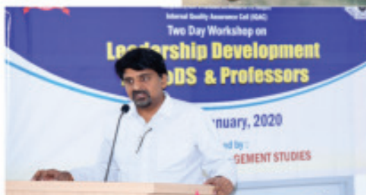
Leadership Development Program for HoDs & Professors - JNNCE