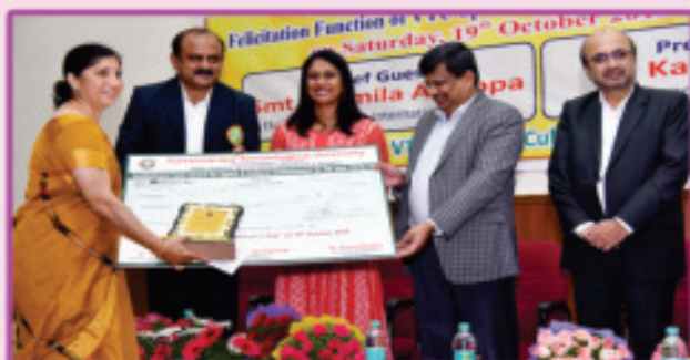
Institutional cash award for Sports & Cultural achievement-2019