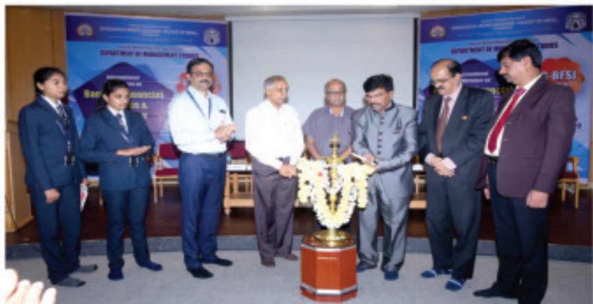
Inauguration of International Conference on Banking, Financial Services and Insurance-MBA