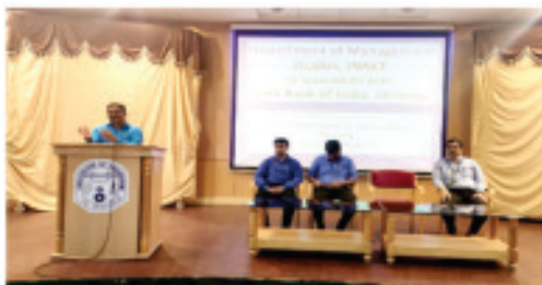
Lecture on Recent Developments in Banking Industry in India - MBA