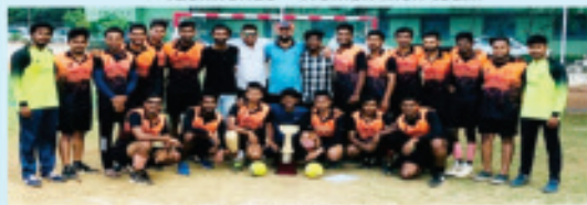
Handball - Men team