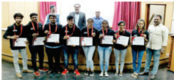
Dance Team First Place in