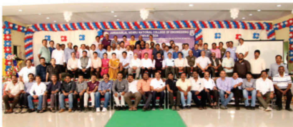
Nellore Alumni Meet 2020 team