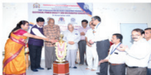
VTU TEQIP-1.3 FDP - EEE