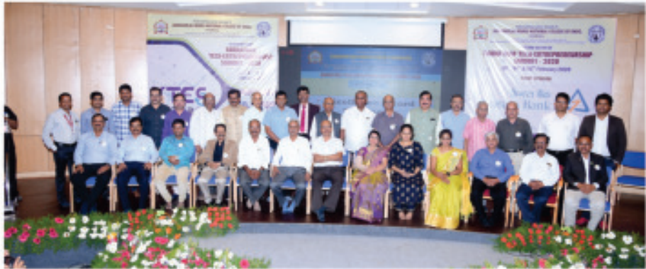
Distinguished Entrepreneur Awardees-KTES 2020