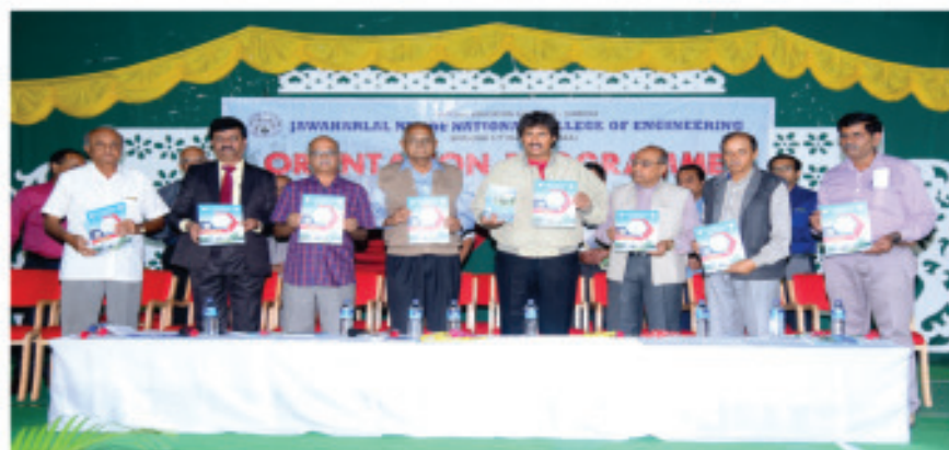
Release of Handbook and Prospectus- 2019