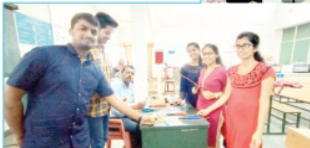
EEE - SDP on Building wiring & Industrial Control