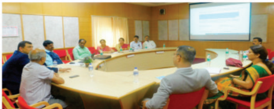
JNNCE-5 Jewels Research: MoU