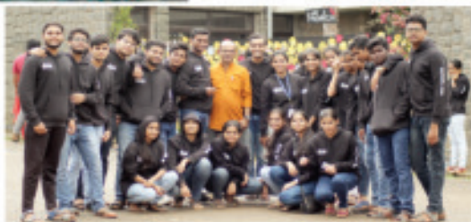
VTU Cultural Fest Team with Team Manager