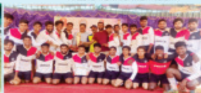
Football - Men team