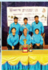
Power lifting Women team