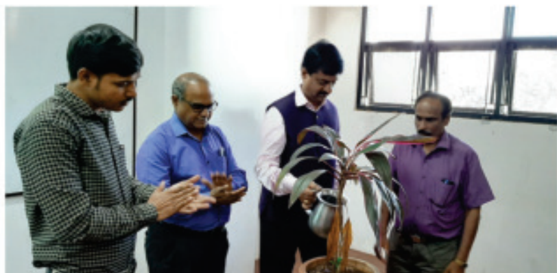
Inauguration of Entrepreneurship Awareness Programme