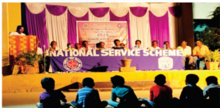
NSS camp -2020 at Navile Basavapura