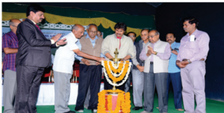
Inauguration of I.B.E. Orientation Program - 2019