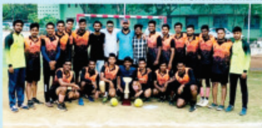
Mens Handball tournament.