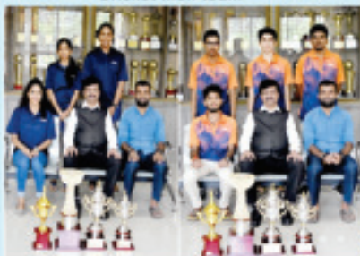
Badminton - Women & Men team