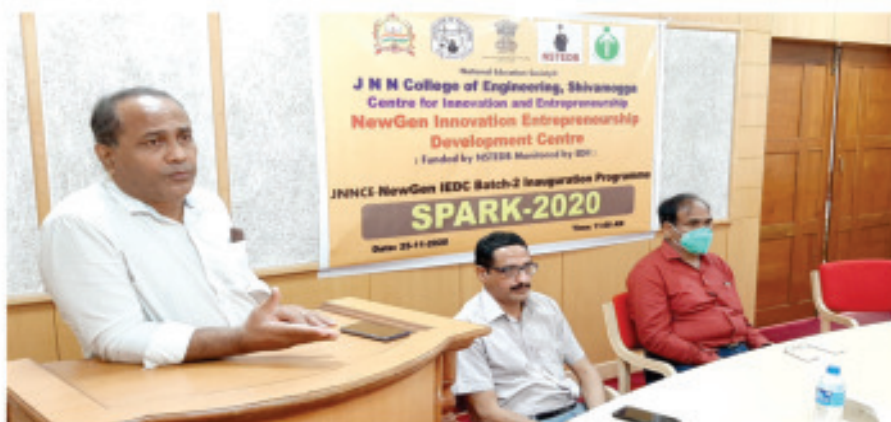
Inauguration Programme of SPARK-2020