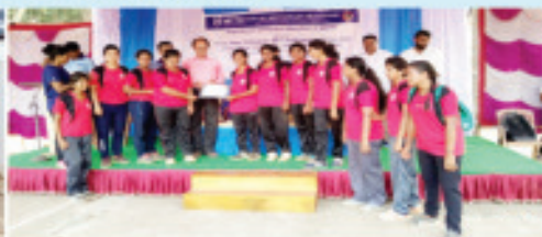
Volleyball Women team