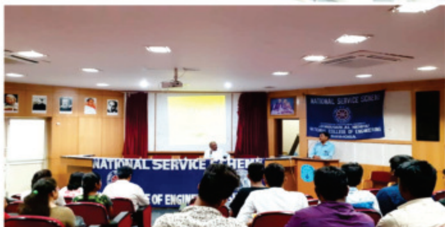
Constitution day Celebration by NSS