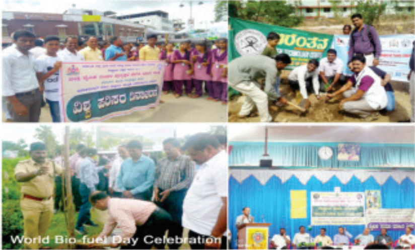
World Bio-fuel Day Celebration