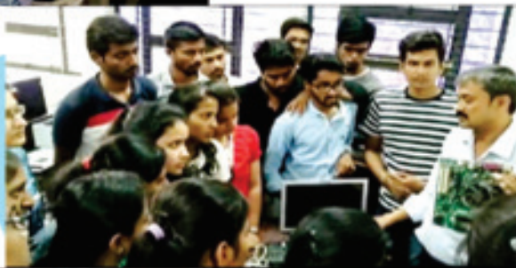
Workshop on Hardware Components & PC Assembling - MCA Dept