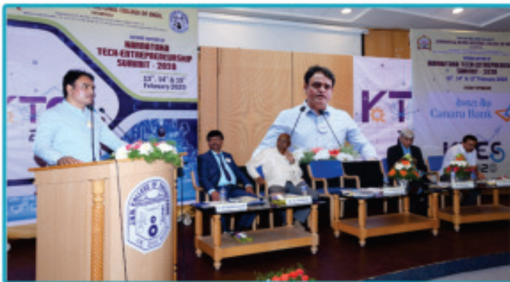
KTES-2020:Inaugural Address by Dr. Ashwathnarayan C. N.,DCM, Govt of Karnataka