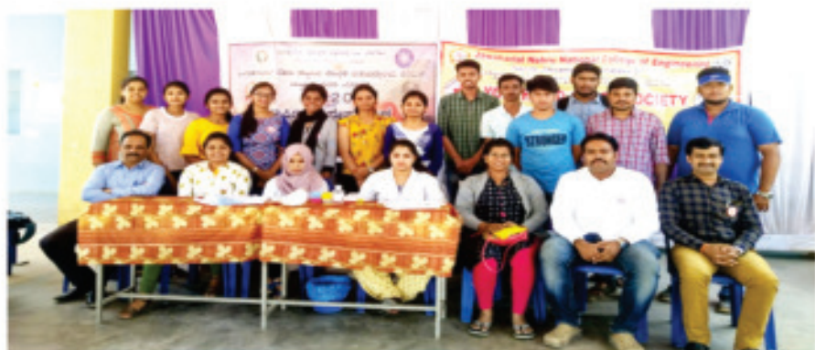
Blood donation Camp- NSS