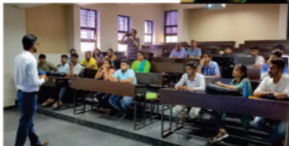
Workshop on Digital Marketing - MBA Dept.