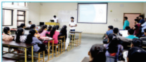
ECE- Line Follower Workshop