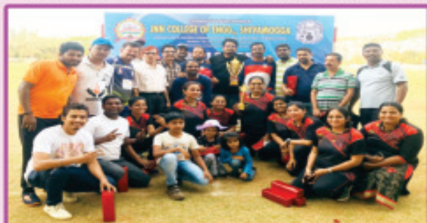
NES Staff Sports Meet 2020