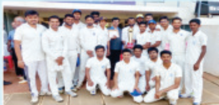
Cricket Men team