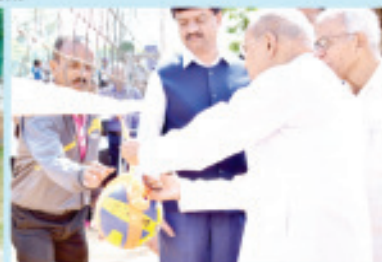
Inauguration of Mens Volleyball tournament