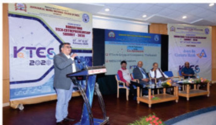
Valedictory Program of KTES - 2020