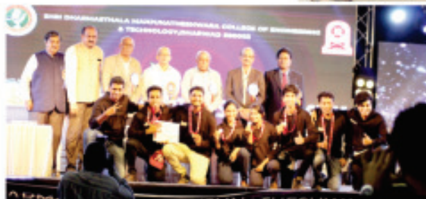
Mime Team First Place