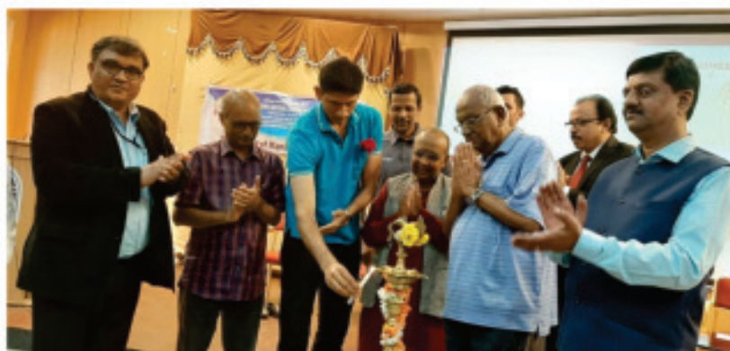
Inauguration of DREAMZ