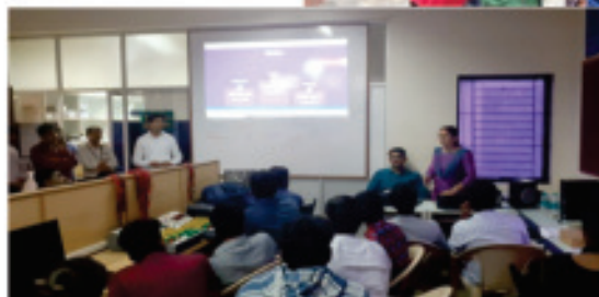
Workshop on Industry 4.0 - TCE Dept.