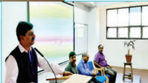
CIE -Entrepreneurship awareness workshop