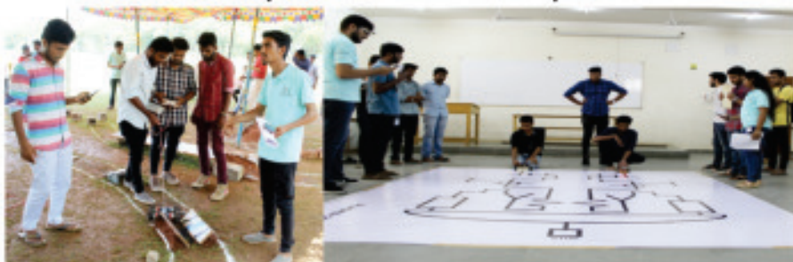
PLASMA 2019 - Activities