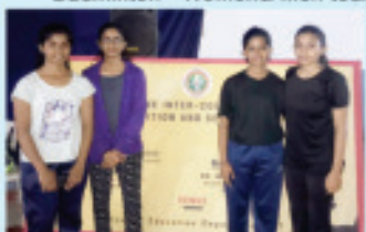
Taekwondo - Women Men team