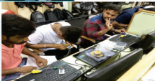
MCA - Technical skill Programme in IOT