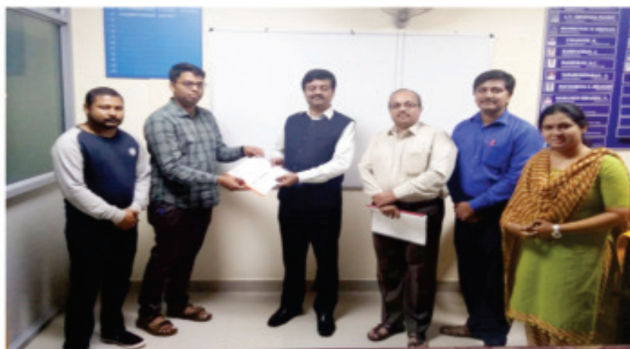
JNNCE-SV Services: MoU