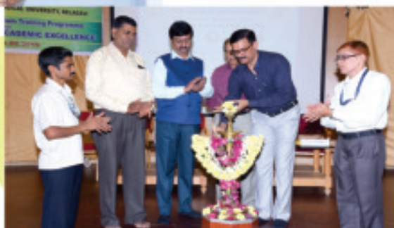
Inauguration of One Day VTU Consortium Training Programme on E-Resources For Academic Excellence - Library