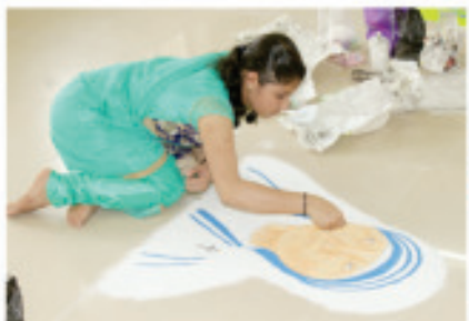
JNNCE team Performance