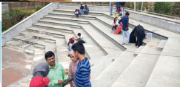
Workshop on Solar Energy Systems - EEE Dept.