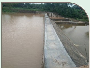
Rechikoppa Check Dam Sub-surface exploration done by the Department of Civil Engineering