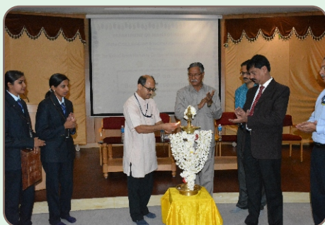
One-day MDP on Business Accounting , on 22 nd Jan 2017 for the employees of MAMCOS