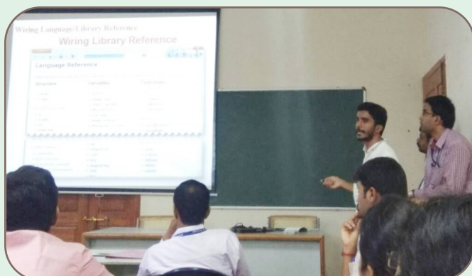
FDP program on Advanced Microcontroller Programming and IOT from 12 th - 16 th June 2017