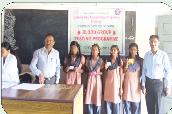
NSS Special Camp in Matturu village, Shivamogga