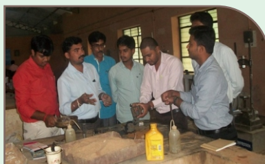
STTP on Soil mechanics and testing for Road, Building, Canal, Embankment and Irrigation Structures for PWD and Irrigation Dept. Engineers