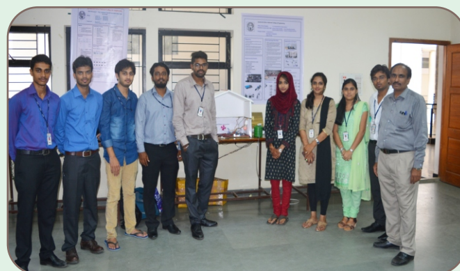
Project Exhibition of final year ECE