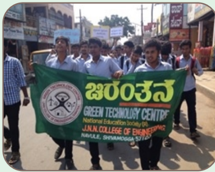
World water day rally