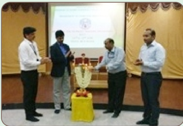
Training program for PG CET applicants on 14 th and 15 th June 2017.