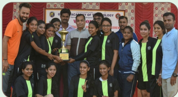
Handball Women team Secured 1 st place at VTU Inter Collegiate Fest of Bangalore zone from 27 th - 28 th March 2017