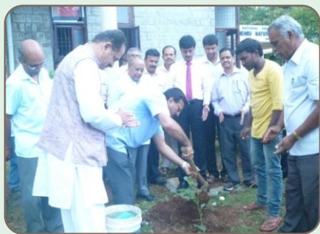
Vanamahotsava at JNNCE