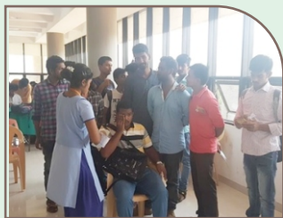
Free eye check-up camp by Shankara Eye Hospital