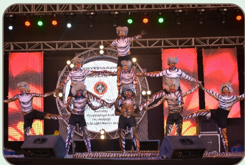
JNNCE bagged 3 rd place in VTU Fest held at Sir.MVIT, Bangalore from 4 th - 7 th April 2017.