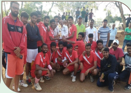
Handball Men team Secured 2 nd place at VTU Central Karnataka zone Handball Tournament from 27 th -28 th March 2017