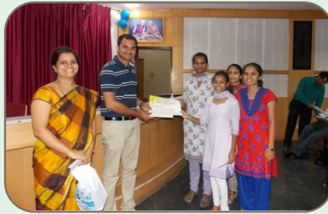
Students receiving certificates for the Best Project