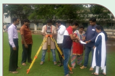
FDP on Applications of Total station in Civil Engineering.