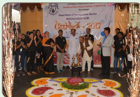
Intercollegiate UG Fest Utthana, theme - Bharath-Sirion on 30 th March 2017