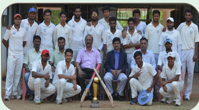
Cricket Men team Secured 1 st place at VTU Central Karnataka zone Cricket Tournament from 21 st -25 th March 2017