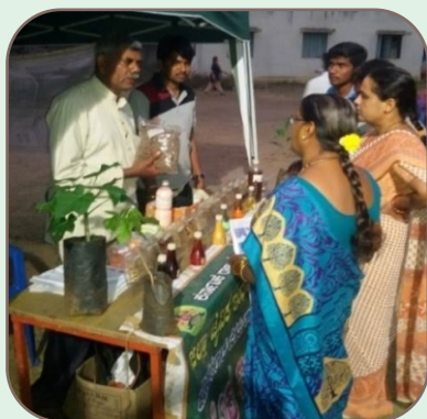
Biofuel Demo at NSS camp