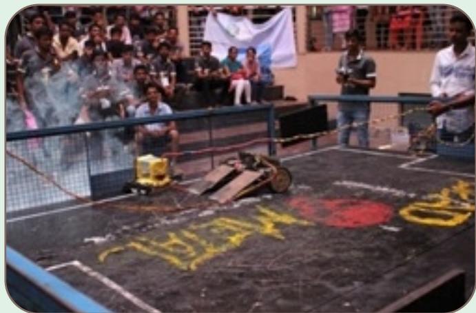
Dead Metal Event at JNNCE

Techzone is a National level technical symposium conducted by the College and IEI Students Chapter jointly. The event is being conducted from 15 years. Techzone provides students a platform to exhibit their technical skills and talents in different fields of Engineering. Students from 15 colleges in and out of Karnataka participated in this year's event. Techzone 2017, held on 5 th , 6 th and 7 th May 2017. Prizes were given to the winning teams in the valedictory ceremony.