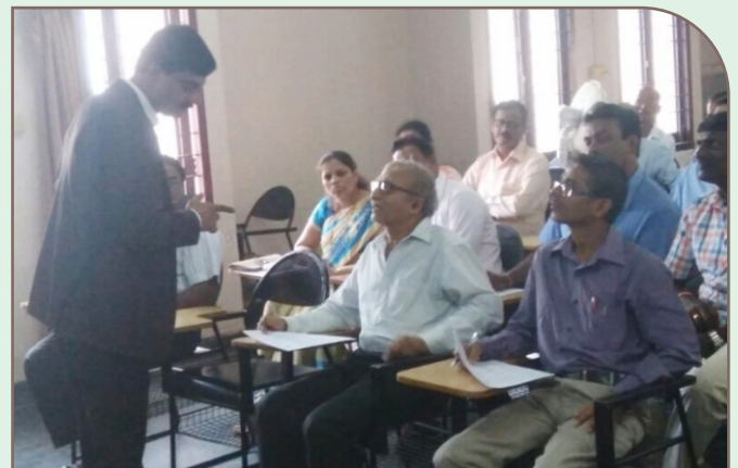
Principal interacting with parents on 8 th April 2017