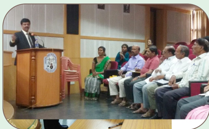
Workshop on Internet Awareness and Digital Transactions for Women and Senior Citizens in association with IETE Shivamogga Centre