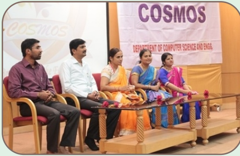
COSMOS inaugural function