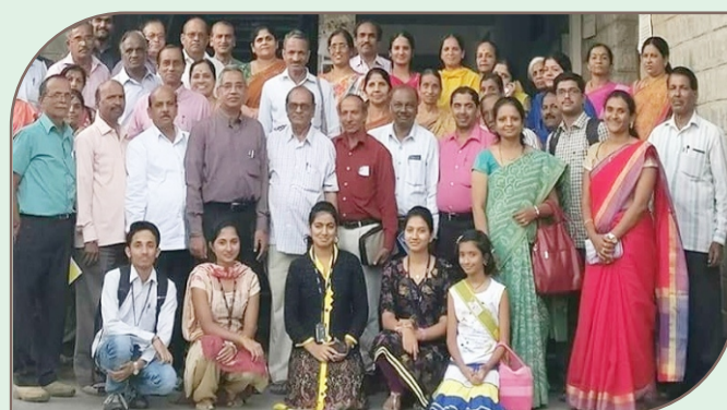
Internet awareness and digital transactions for women and senior citizens on 17 th & 18 th of March 2017