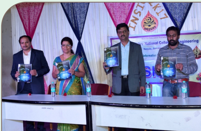
INSIGHT Valedictory function and Koushalya Deepa magazine release on 20 th May 2017