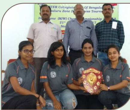
Chess Women team Secured 3 rd place at VTU Inter Collegiate Fest of Bangalore zone from 21 st - 22 nd April 2017