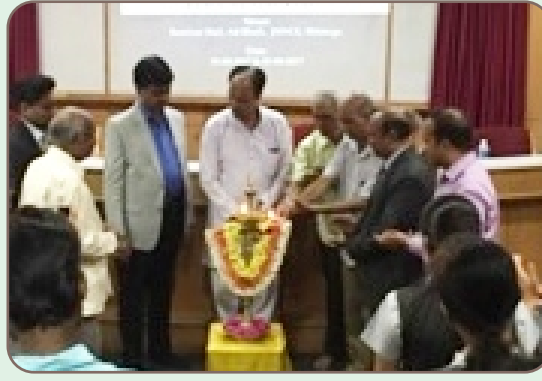
2 day workshop on IOT for MCA students during on 31 st March and 1 st April 2017