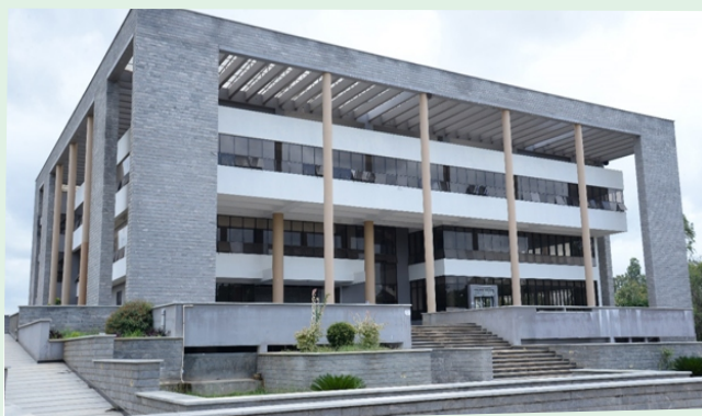
Jawaharlal Nehru National College of Engineering, Shivamogga.

JNNCE organises Alumni meet every year at JNNCE campus and outside. This year's Alumni meet was organised at Delhi on 10 th June 2017.