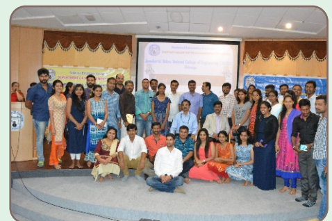
Alumni Meet- Anubandha organized on 7 th May 2017