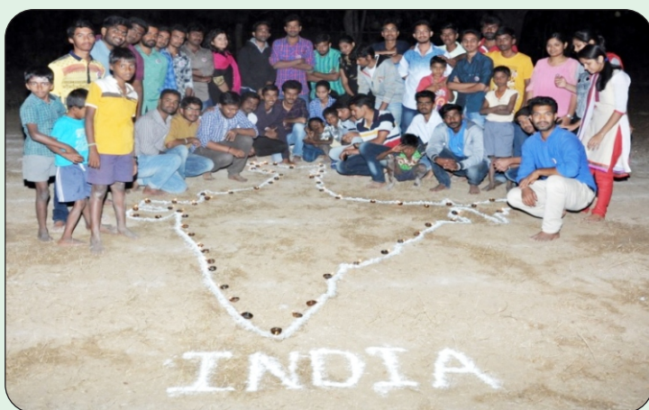
Blood donation motivation & Blood Group Testing program.