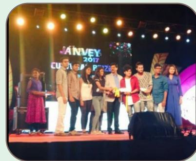
Prize distribution in JANVEY 2017