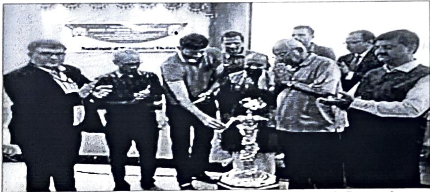
Former Indian cricket player B K Venkatesh Prasad inaugurates a personality development programme in Shivamogga on Saturday.