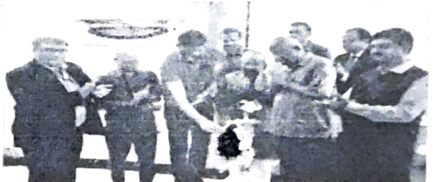
Former Indian cricket player B K Venkatesh Prasad speaking at an event.

ಉದ್ಯಮಿಯಾಗುವುದು ಒಂದು ದೀರ್ಘಕಾಲದ ಪ್ರಕ್ರಿಯೆ. ಅದರಲ್ಲಿ ಯಶಸ್ಸು ಸಾಧಿಸಲು ಬಯಸುವವರು ತಮ್ಮನ್ನು ಸಿದ್ಧಗೊಳಿಸಿಕೊಳ್ಳುವುದು ಅಗತ್ಯ. ಉದ್ಯಮಿಯಾಗುವುದು ಒಂದು ದೀರ್ಘಕಾಲದ ಪ್ರಕ್ರಿಯೆ. ಅದರಲ್ಲಿ ಯಶಸ್ಸು ಸಾಧಿಸಲು ಬಯಸುವವರು ತಮ್ಮನ್ನು ಸಿದ್ಧಗೊಳಿಸಿಕೊಳ್ಳುವುದು ಅಗತ್ಯ.