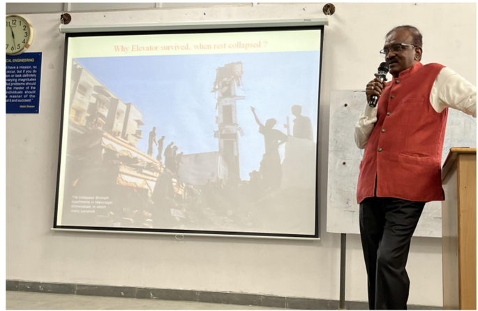
1 and 2