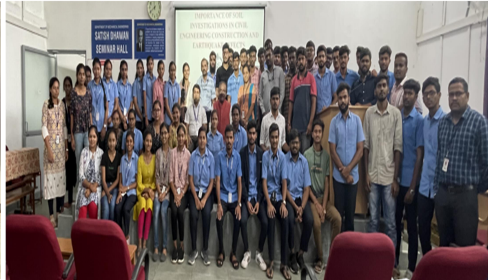
3 and 4